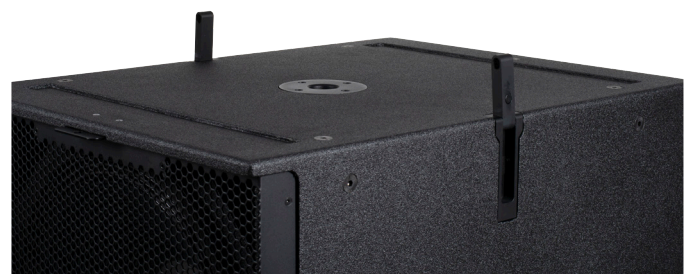
Built-in interlocking stacking hardware